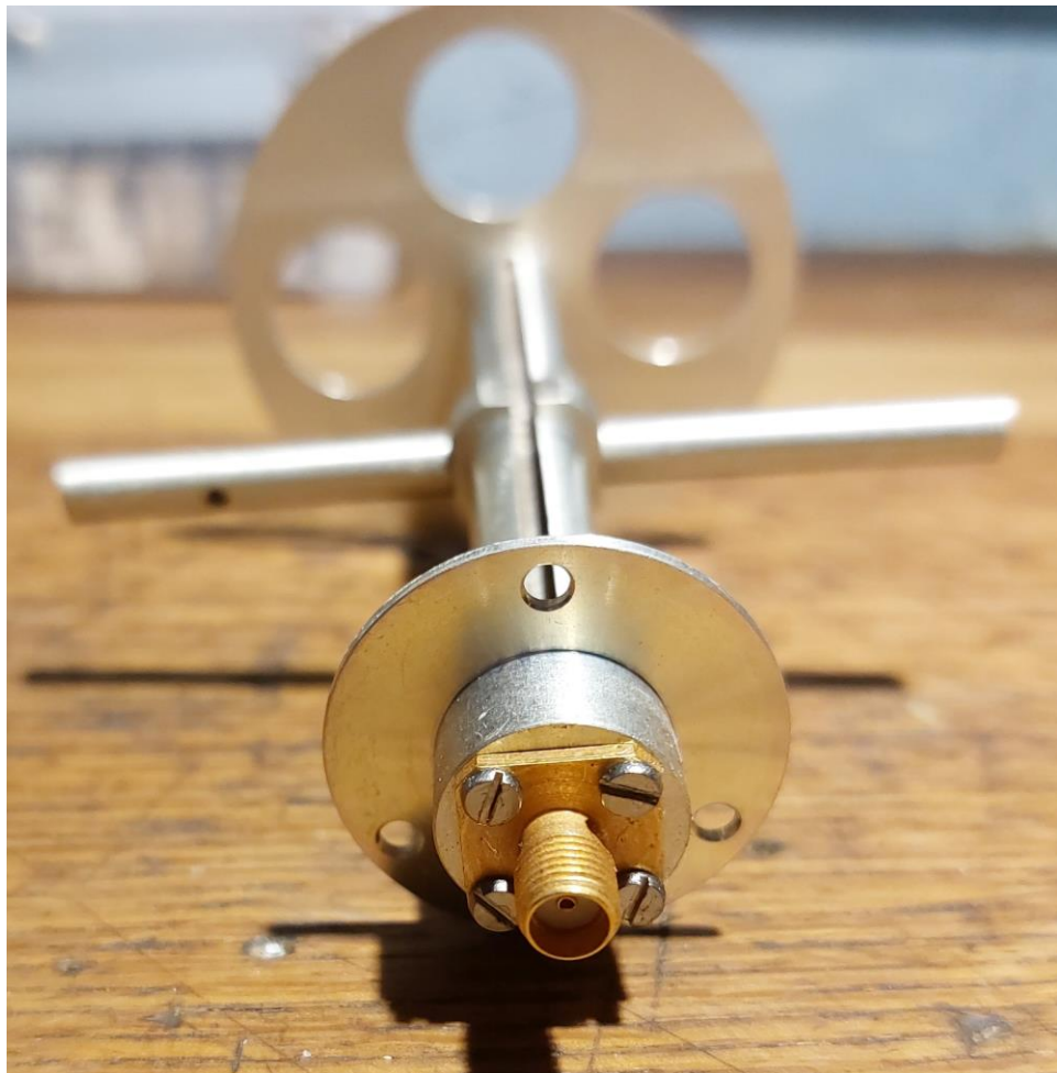
The input connector is an SMA jack. The barrel to which the jack is attached is normally most likely mounted in a reflector plate and fixed with 3 screws through the holes in the round disk.