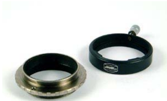
Baader T2 Quick-Changer System

So I need an adapter from 2" to T2. I first thought of stacking 2 adapters which I already had available but I disliked the mechanical length. So I asked a friend of mine with a nice tool shop and he machined a single adapter which is much shorter. The optimum distance between the Alan Gee II and the eyepiece's focal plane is 121mm. Because of the T2 system I can use the filter wheel as shown later and still achieve focus.