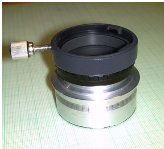
Adapter 2" to T2 quick changer incl. AG II (Alan Gee focal reducer, #2)