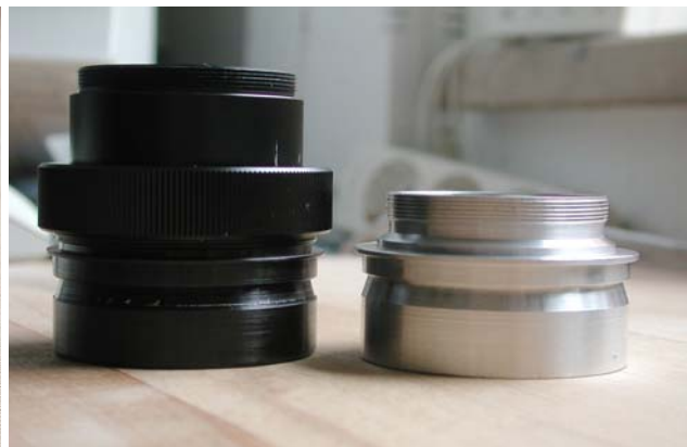
Both pictures at left: 2 stacked adapters 2" to SC & SC to T2, at right: new adapter 2" to T2