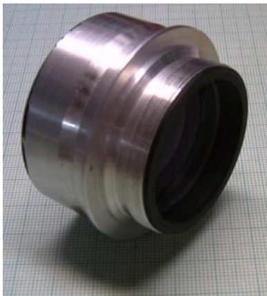
Alan Gee II in adapter