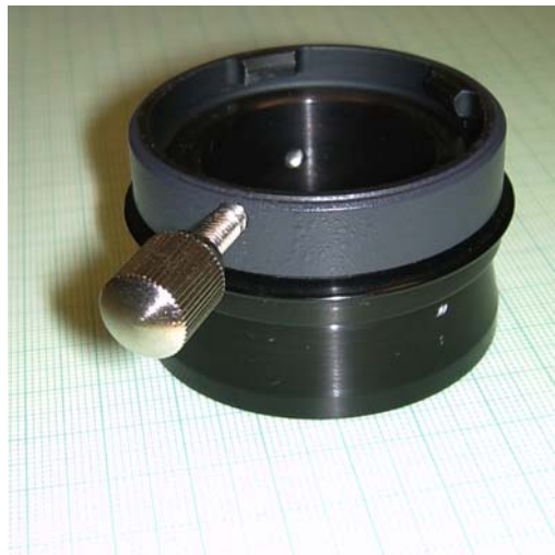
Adapter 2" to T2 quick changer only (without any optical elements, #1)

Here are the modules I insert into the 2" clamp depending on the needed focal ratio: