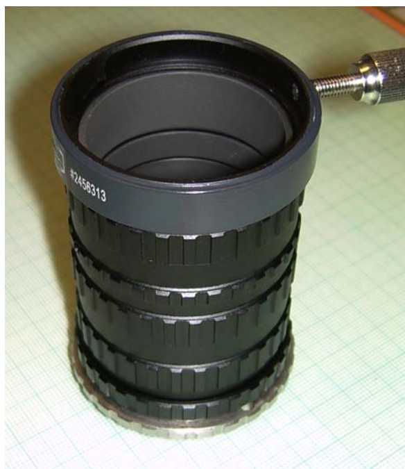
Adapter T2 to T2 including Barlow lens (#3) (Barlow lens with multiple T2 extension rings, changing the length of the adapter by inserting/removing extension rings varies the effective magnification of the Barlow)