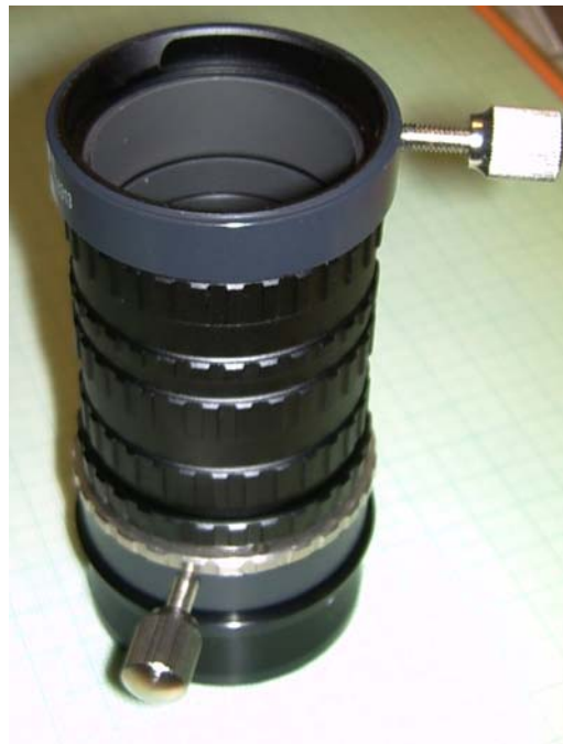
Barlow assembly #3 stacked on adapter #1 (This is how it is inserted when used)