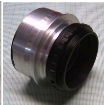
T2 extension clamping Alan Gee II