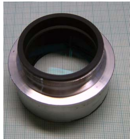
Alan Gee II plugged into adapter