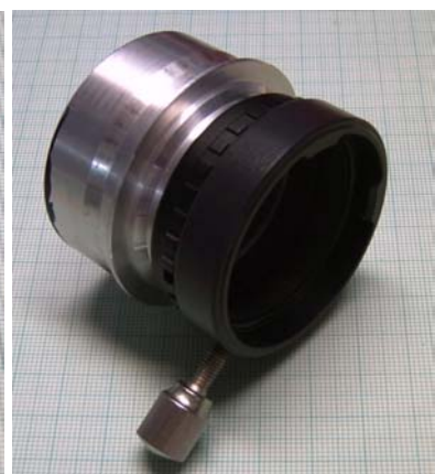
T2 quick changer on T2 Extension