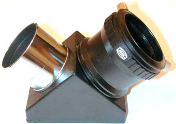
2" Baader Maxbright Star diagonal

The common interface for all combinations / configurations is the 2" clamp of my Baader Maxbright Star diagonal. From here I either use 2" eyepieces or change to my 1 1/4" equipment which is all adapted by the Baader T2 quick-changer system.