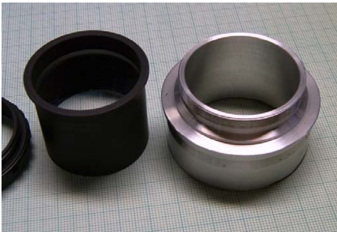
Alan Gee II left before plugged into adapter

In the next pictures you can see how the setup is assembled. The Alan Gee II is plugged into the new adapter. Then a 7.5mm T2 extension (with a T2 outside thread at one side and a T2 inside thread at the other side) is screwed on and effectively clamps the Alan Gee II in the adapter. Then the T2 quick changer is screwed onto the T2 extension.