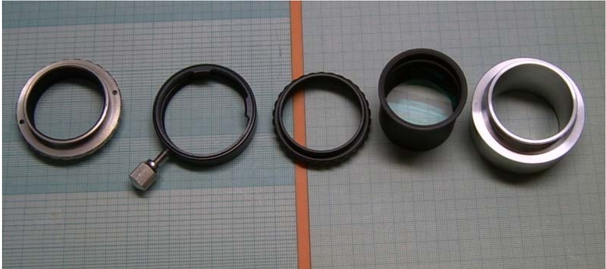
From left to right: T2 quick change ring, T2 quick changer, T2 extension 7.5mm, Alan Gee II, special adapter 2" to T2 which also holds the Alan Gee II

In the next pictures you can see how the setup is assembled. The Alan Gee II is plugged into the new adapter. Then a 7.5mm T2 extension (with a T2 outside thread at one side and a T2 inside thread at the other side) is screwed on and effectively clamps the Alan Gee II in the adapter. Then the T2 quick changer is screwed onto the T2 extension.